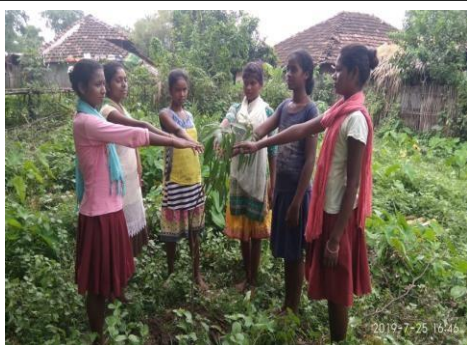
Plantation by Adolescents Girls

The organization dedicates a significant part of its intervention efforts on developing soil and water management through ridge to valley approach. Programmes comprise of enhancing productivity in agriculture; diversifying into new crops; setting up irrigation systems; and instituting entirely new ways of managing the natural resource base.